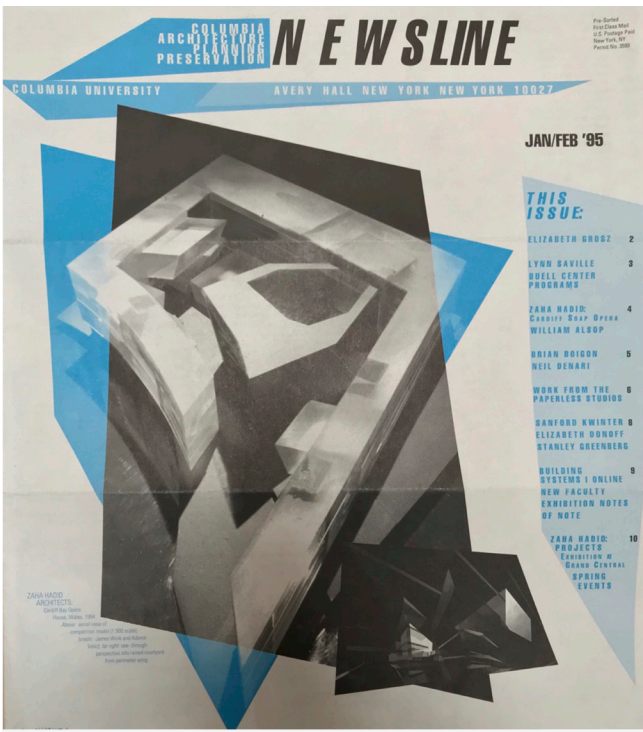
Figure 1. Cover of Newsline (January/February 1995).

objects, while in the case of augmented virtuality users interact with the virtual environment within a context characterised by the fusion of the virtual and physical objects. In other words, in the case of augmented reality, virtual and physical objects are displayed seamlessly. As Xiangyu Wang notes, in “Augmented Reality in Architecture and Design: Potentials and Challenges for Application”, “[a]ugmented [r]eality [...] is a technology or an environment where the additional information generated by a computer is inserted into the user’s view of real world scene” 4 . Both virtual and augmented reality extend the sensorial environment of an individual by mediating reality through technology.